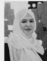
Azza Al Qubaisi