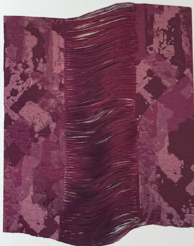
Areen Hassan Revelation 2024 Silkscreen printing and unraveling on textile 450x320cm